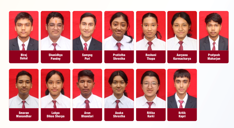
Top performers in Grade XI First and Second Term from the {\bf Management\, stream} in no any particular order

Top performers in Grade XI First and Second Term from the {\bf Science\ stream} in no any particular order